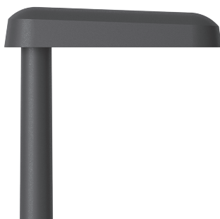
Luminaire and pole polyester powder coated, anthracite (DB 703)