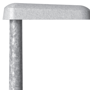
Luminaire aluminium vibratory finished, pole made from hot-dip galvanized steel