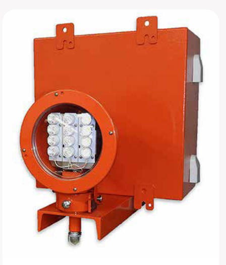
ADB SAFEGATE's new LED REIL light